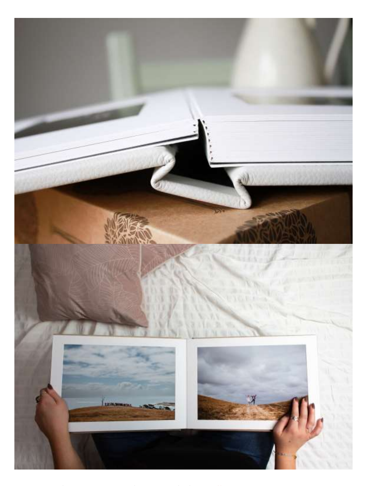
For more design options please see below Album TAB